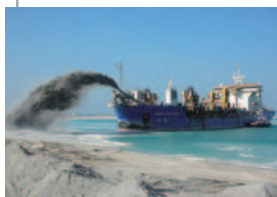
Self-propelling trailing suction hopper dredger, "QUEEN OF PENTA-OCEAN", (currently ANDROMEDA V) put into commission in Singapore (1999)