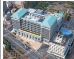
Completion of Kure City Hall (2015)