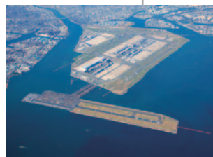
Opening of D-Runway of Tokyo International Airport (2010)