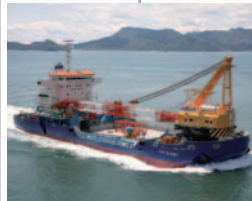
Completion of a large-scale self-propelled multi-purpose working vessel, "CP-5001" (2012)