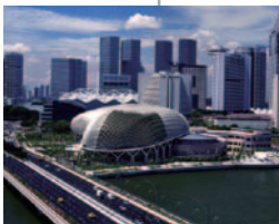
Completion of Esplanade-Theatres on the Bay in Singapore (2002)