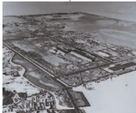
Contract awarded for construction of coastal industrial zone for NKK Corporation (currently JFE Engineering) in Fukuyama City (1961) Stock listed on the Second Section of the Tokyo Stock Exchange (1962) Stock listed on the First Section of the Tokyo Stock Exchange (1964)