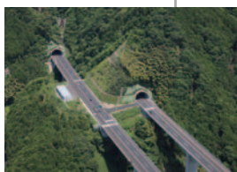
Completion of Kogouchi Tunnel of New Tomei Expressway (2005)