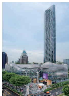
Completion of ION Orchard, and the Orchard Residence in Singapore (2010)