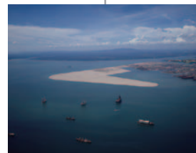
Contract awarded for Tuas Reclamation in Singapore (1984)