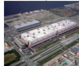
Completion of the World Cargo Distribution Center (1993)