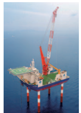
Completion of a multipurpose self-elevating platform, "CP-8001" (2018)