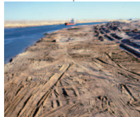
Contract awarded for Suez Canal expansion (1961) Contract awarded for Suez Canal Widening and Deepening (1974)