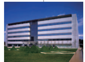
Completion of New Institute of Technology in Nasushiobara City, Tochigi Prefecture (1994)