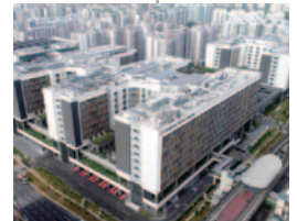
Completion of Sengkang Integrated Hospital in Singapore (2018)