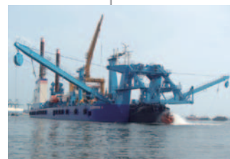
Completion of a self-propelled cutter suction dredger, "CASSIOPEIA V" (2014)