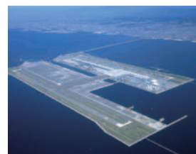
Contract awarded for phase I of construction of artificial island for Kansai International Airport (1986) Contract awarded for phase II of construction of artificial island for Kansai International Airport (1999)