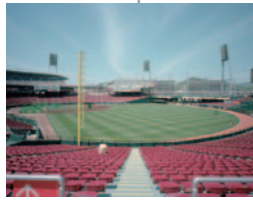
Completion of MAZDA Zoom-Zoom Stadium Hiroshima (2009)